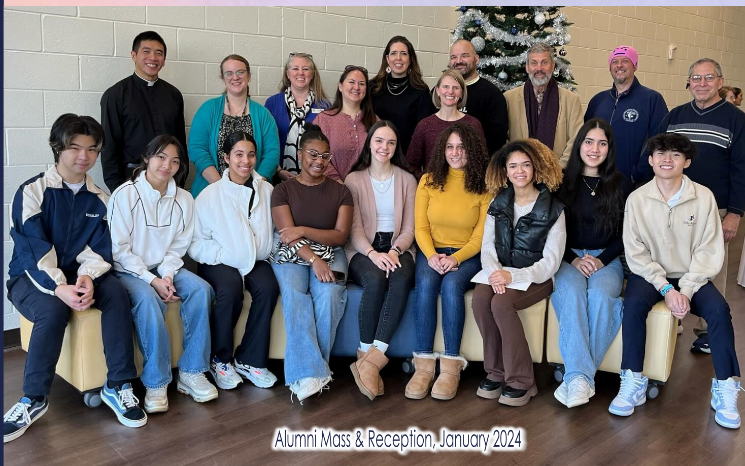
Alumni Mass & Reception, January 2024

Aladdin Jr. the Musical - March 28-29, 2025