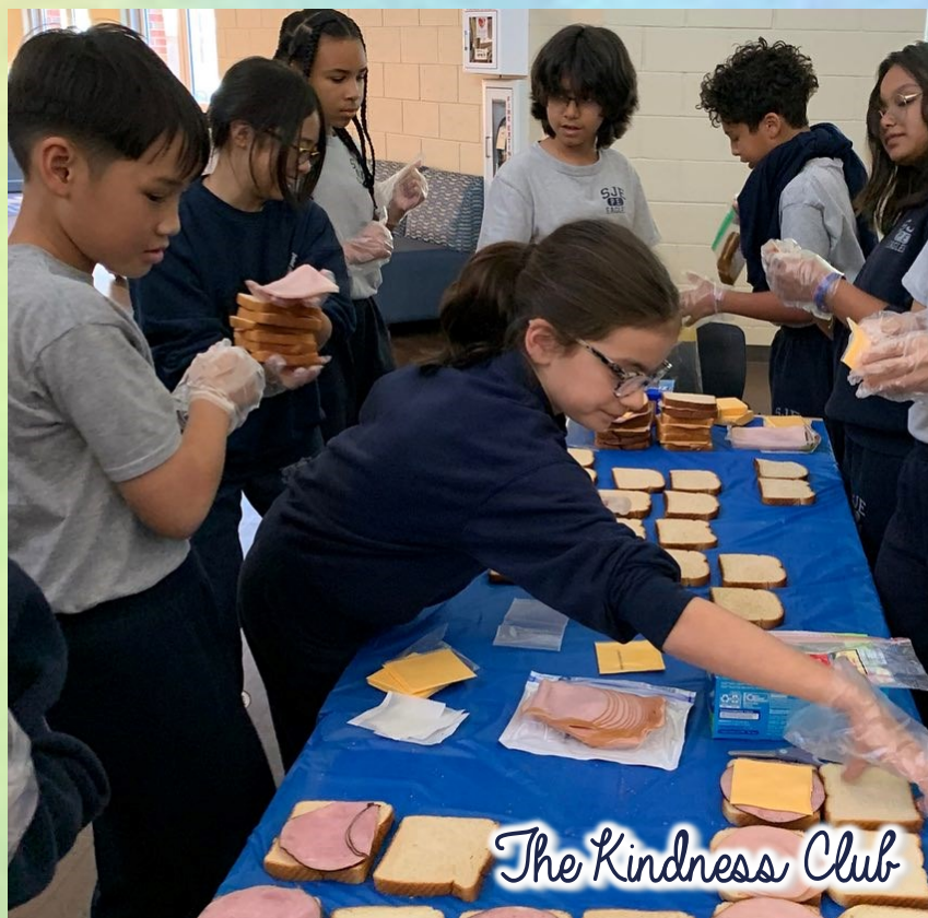
The Kindness Club