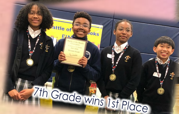
7th Grade wins 1st Place