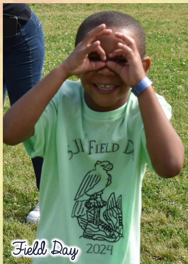
Field Day 2024