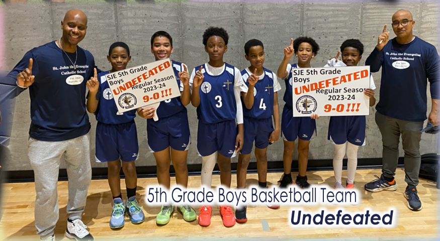
5th Grade Boys Basketball Team