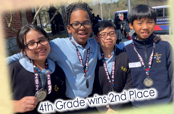
4th Grade wins 2nd Place