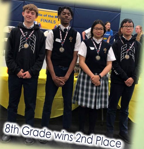
8th Grade wins 2nd Place