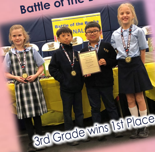
3rd Grade wins 1st Place