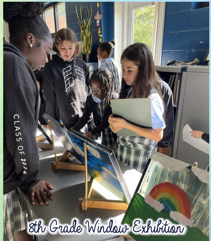
8th Grade Window Exhibition