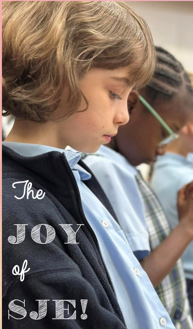
The JOY of SJE!