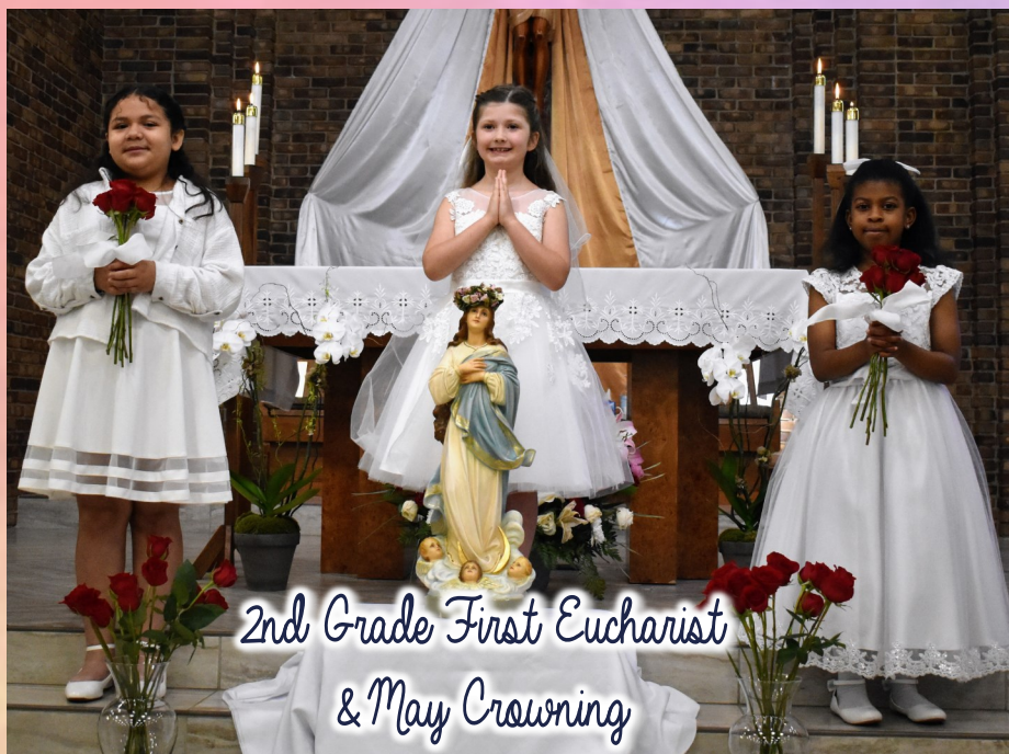
2nd Grade First Eucharist & May Crowning